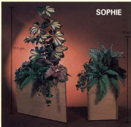
Ref: SOF/H Planter Tri: 60L x 43W x 40H SOF/L Planter Squ: 29L x 29W x 40H