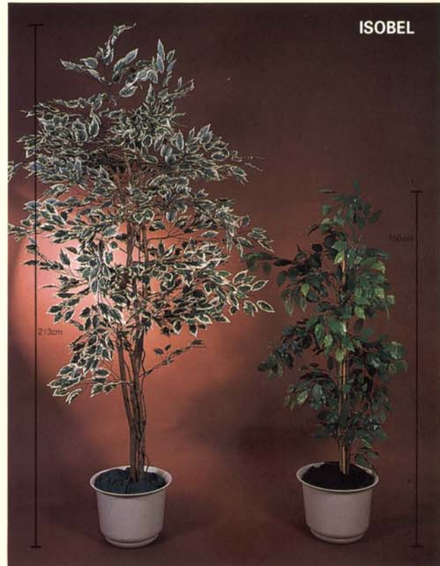
Ref: ISO/H ISO/L Planter Ø35.5 x 26H