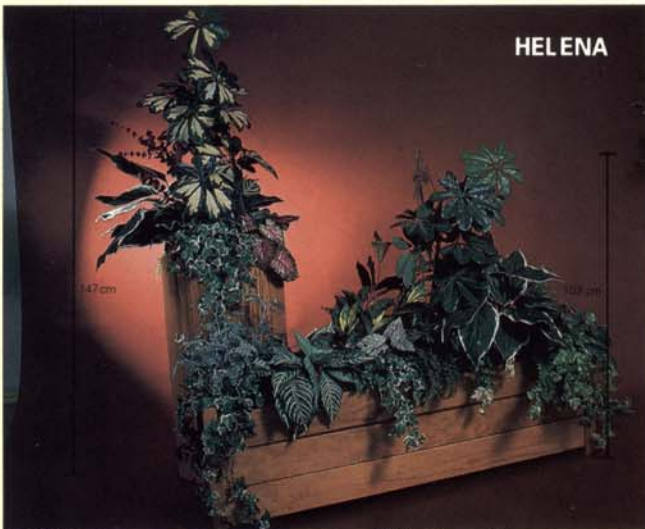
Ref: HEL/H Planter 29L x 29W x 73H HEL/L Planter 123 L x 29W x 39H