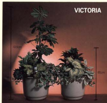
Ref: VIC/H VIC/L Planter Ø35.5 x 26H

Compliment your decor with a choice of planters