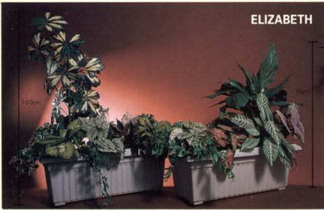
Ref: ELIZ/H ELIZ/L Planter 695L x 31W x 26H