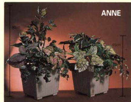
Ref: ANN/H ANN/L Planter 35L x 35W x 30H